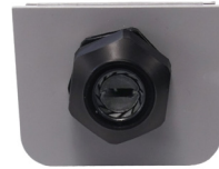
Multi-Purpose Strain Relief