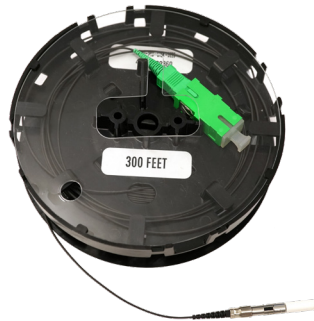
Slack Storage Reel - 50 and StrongFiber Deploy Reel