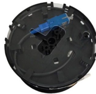
FLEXdrop Deploy Reel