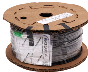
Lengths from 32' to 350' (9.75 m to 106.68 m)