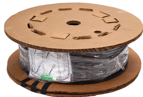
Lengths greater than 350' (106.68 m)