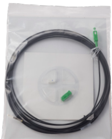
Lengths up to 32' (9.75 m)