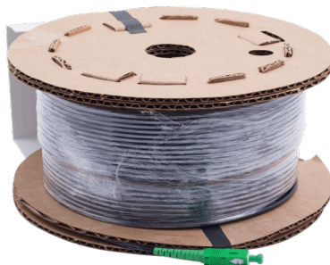
Lengths from 50' to 350' (9.75 m to 106.68 m)