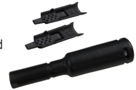
Field Installable FlexConnector