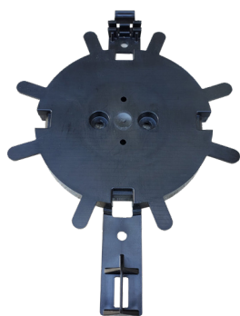
Deploy Reel Mounting Plate