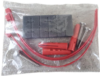
Adapter and Splice Sleeve Accessories