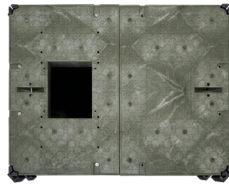
Split Thermoplastic Cover with Cutout in ½ Lid

Application: Clearfield Passive Cabinets and Pedestals Mounting: New cabinet and/or pedestal deployment Static Load: 5,000 lbs