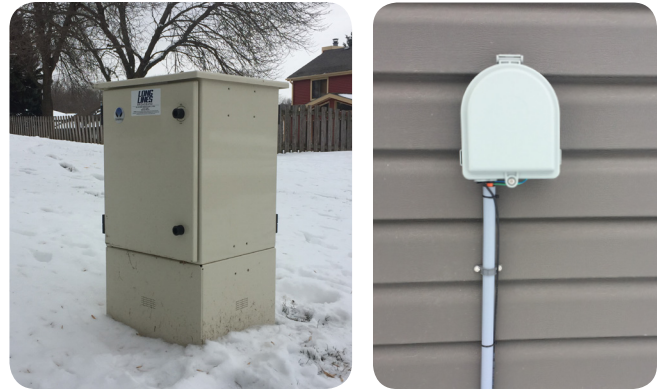
FieldSmart 144-port cabinet and YOURx-TAP.

The Clearfield YOURx-TAP equipped with a FieldShield StrongFiber Deploy Reel served as the demarcation point on the side of the house with fiber connection back to the OSP terminal. During customer turn-up, a technician pulled the desired amount of StrongFiber off the reel (through the microduct) to the terminal and the unused portion of cable remained stored on the reel for an integrated slack storage solution. At the terminal, an easy-to-install, snap-on connector housing eliminated splicing and completed the termination process providing simple plug-and-play connectivity. Residents appreciated the small size of the YOURx-TAP because it eliminated the need for a large, unsightly box on the side of a home to store excess fiber. The YOURx-TAP also provided the final drop point in a completely protected fiber pathway.